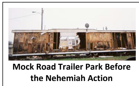
Mock Road Trailer Park Before the Nehemiah Action

BREAD and BREAD-member congregations have taken successful action on several community issues in its thirteen years of existence. Each of these issues has improved the quality of life in our community; several issues brought about permanent changes that will have a long-lasting impact on Columbus. Listed below is a sample of some of the issue victories of the organization: