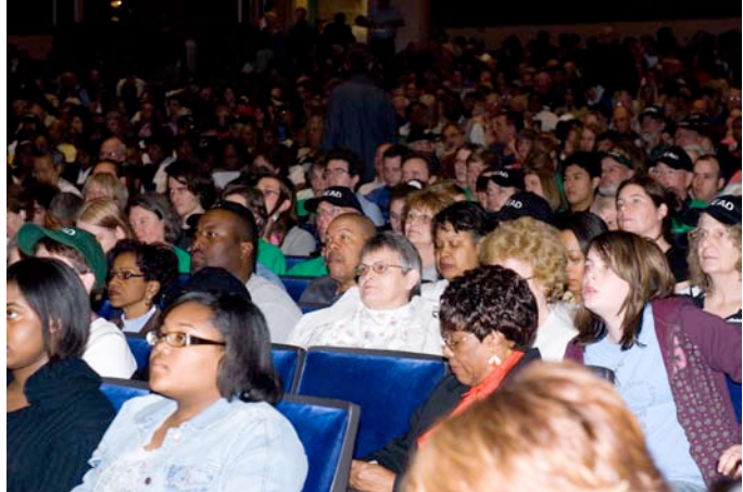
2,576 people called for justice at the 2009 BREAD Nehemiah Action Meeting on Monday, May 4 at Veterans Memorial

The mission of the BREAD Organization is to build the power of people of faith to act effectively to solve local community problems. BREAD, through its member congregations, listens to surface community problems, researches problems to develop winning issues, mobilizes its members to get commitments from public officials to implement those solutions, and follows through to make sure that those commitments are enacted. The organization is a broad-based 501 (c)(3), non-profit corporation, non-partisan, interfaith and multi-racial.